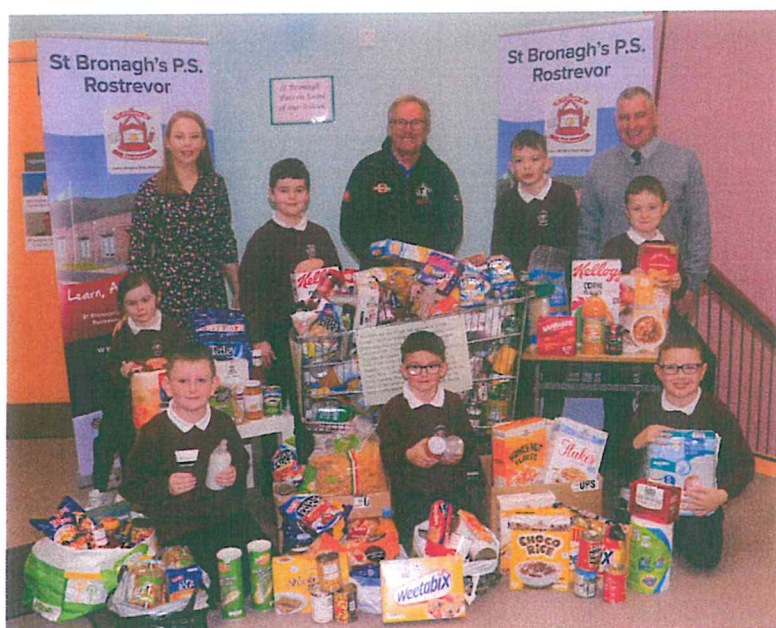
Donation of non-perishable foods and personal care items to "The Larder Foodbank, Newry."